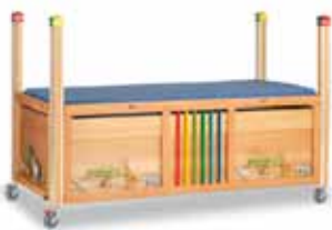
Timmy I DeLuxe coloured. Lowered long-side lattices and manually lowered side lattices