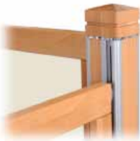
Timmy DeLuxe close-up of the aluminium post