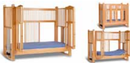
Olaf 135 natural wood showing profiling (bottom right) Olaf 98 natural wood 140 x 70cm (top right) Olaf 135 natural wood with doors open (left)