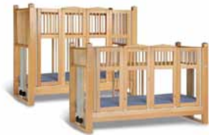
Examples of the mutiple settings and the very low access