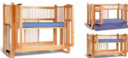
Olaf 135 natural wood raised lying surface (left) Olaf 98 natural wood with doors open and entry aid (top right) Olaf 98 natural wood with lying surface in highest position (bottom right)