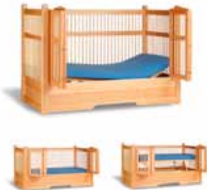
Hannah 98 natural wood with doors open (top) Hannah 70 natural wood in angled mattress setting (bottom left) Hannah 70 natural wood with lying surface raised (bottom right)