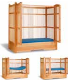
Hannah 170 natural wood with doors open (top) Hannah 135 natural wood with raised and angled lying surface (bottom left) Hannah 135 natural wood with raised lying surface (bottom right)